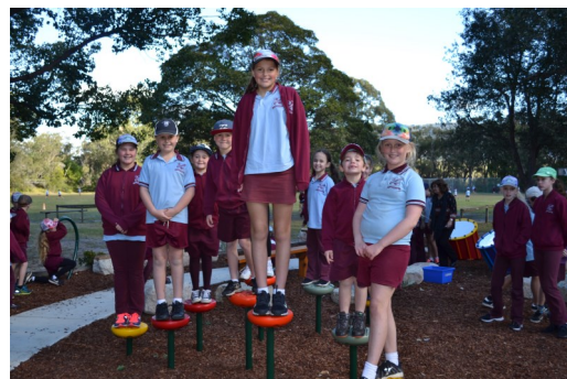
Children of all ages enjoying the new sensory garden!