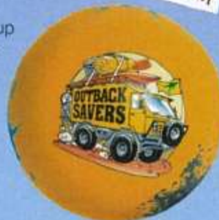
Mud Splat Handball