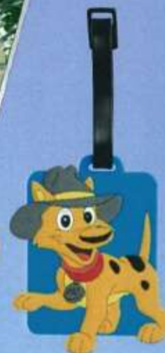
Outback Pat Bag Tag